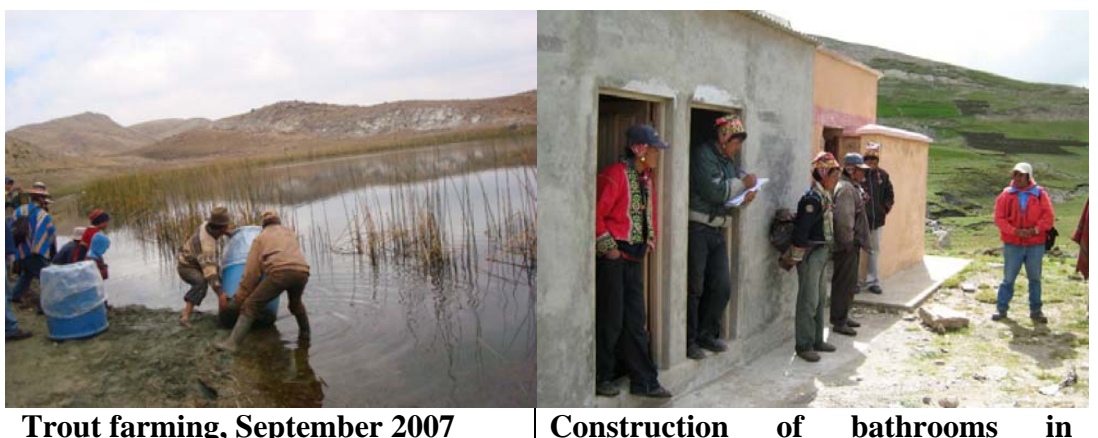
Construction bathrooms of in Kalachaca

52. Bolivia alleges that the Company's contribution of a chapel to the Kalachaca community (as well as similar contributions) was not a "real benefit."<sup>100</sup> First. this contribution was made in response to a specific request received by the Company in May 2007.<sup>101</sup> The materials required for the chapel (including size and specifications) were provided by the Kalachaca community.<sup>102</sup> Second, this request was one of the first made by the communities, which is why it was particularly important for the Company. Lastly, the Government was satisfied with CMMK's contributions: CMMK informed the Government about this and other contributions to the communities and the Government never provided any negative comments regarding any of them.<sup>103</sup>