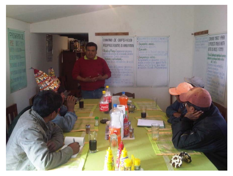
RCA Discussions between CMMK and Ayllu Tacahuani, June 17, 2011

2011;<sup>140</sup> (iii) ayllu Qullana on August 10, 2011;<sup>141</sup> and (iv) ayllu Tacahuani, on August 20, 2011.<sup>142</sup>