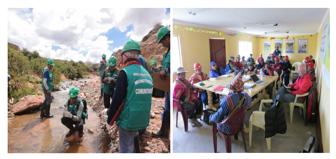
Environmental monitor training program, March 2012