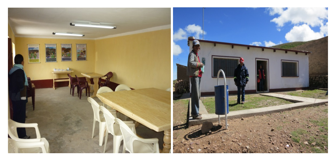
Reconditioned Community Center, January 2012

68. The foregoing activities not only evidence the different commitments that the Company undertook and fulfilled, but also show the collaborative atmosphere that existed at that time between the Company and the communities, as well as the communities' interest in the continuation of the Project.