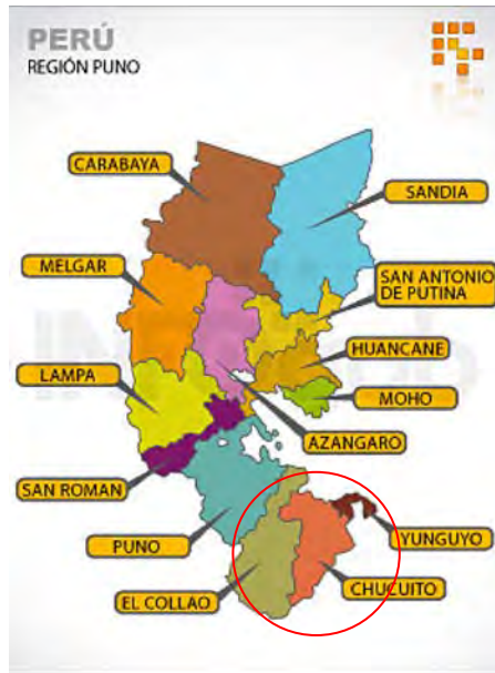
Figure 2 Map of Puno Department. The Santa Ana Project is located in the Chucuito Province, which is in the South East of the Puno Department. 109