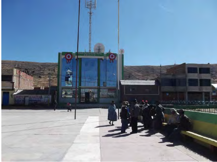
Picture taken from the urban area of Kelluyo. July 21, 2015. 112

80. Critically, the Santa Ana Project site is located on the territory of multiple Comunidades Campesinas . In Peru, a Comunidad Campesina is a social organization of indigenous people, in this case the Aymara people. 113 Under Peruvian law, these communities have certain rights with respect to their land. In particular, communities' land is inalienable—while it may be subdivided among members of the community (typically family units), it cannot be sold to persons outside the Comunidad , unless two thirds of the Comunidad agrees. 114 This had a significant impact on the way Bear Creek had to relate to the local communities. Bear Creek could not simply purchase the land for the Project and then develop it at will. Instead, Bear Creek was going to need to persuade the local communities possessing the Project site lands, and the individual land-holders within the communities, to agree to give Bear Creek land use authorization for all of the activities necessary to develop the open-pit Santa Ana mine—and