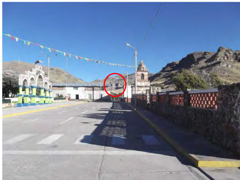
Picture taken from the urban area of Huacullani, July 20, 2015. 111 The Santa Ana project site is circled in red.

79. The pictures below illustrate just how close the Project was to the areas where the members of the communities live their daily lives. In the first picture, taken from the center square of the Huacullani urban area, the project site 3 km away is circled in red. In the second picture, taken from the center square of the Kelluyo urban area, the project site is just on the other side of the hill pictured behind the buildings. Bear Creek engaged with certain communities in the first area, but did not secure the cooperation or support of the second.