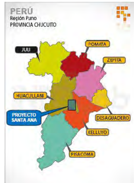
Figure 3 Map of Chucuito Province. The Santa Ana Project is located between the Huacullani and Kelluyo Districts of the Chucuito Province. 110