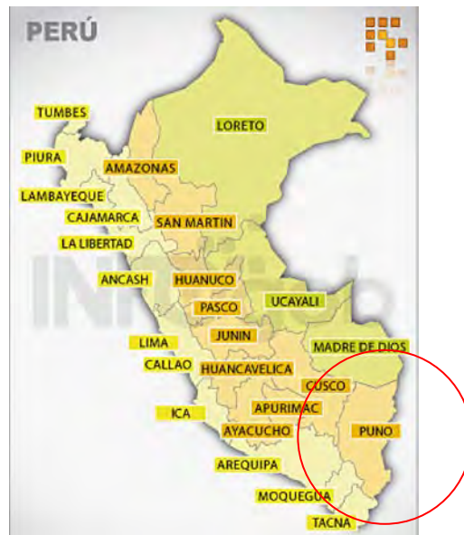
Figure 1 Map of Perú. 108

76. The Santa Ana Project is located in the South of the Department of Puno. As indicated on the map below, the Puno Department is located in the southeast of Peru along its border with Bolivia.