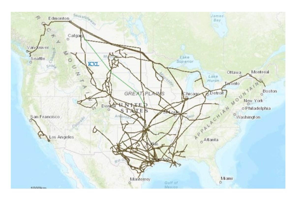
North American Cruoil de Oil Pipeline Network<sup>100</sup>