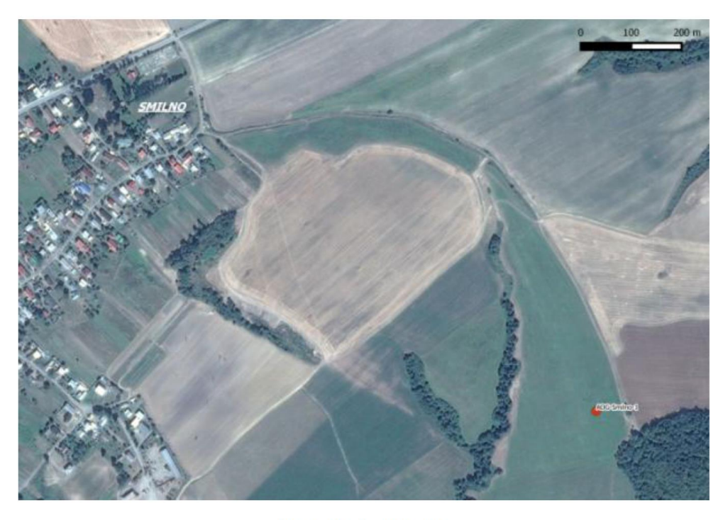
AOG-Smilno-1 well location