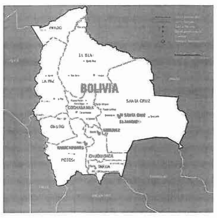
Map of Bolivia showing location of Guaracachi's power plants<sup>18</sup>

(namely, the Guaracachi, Aranjuez and Karachipampa stations, shown on the map below).