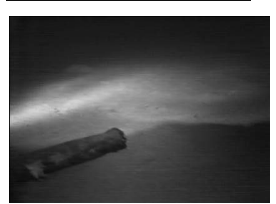
Image 2 – Image of Cannon Identified During Phase Two <sup>78</sup>

stones.<sup>75</sup> The nature and spread of the debris was consistent with a ship that had sunk following extensive damage, as observations of "the piles of wood occurred in a large area that could cover an area a mile long by tens or hundreds of meters wide."<sup>76</sup> These observations had been confirmed by earlier visual inspections by the TREC, which had revealed piles of wood that resembled planks used to build the San José as well as a cannon, pictured below.<sup>77</sup>