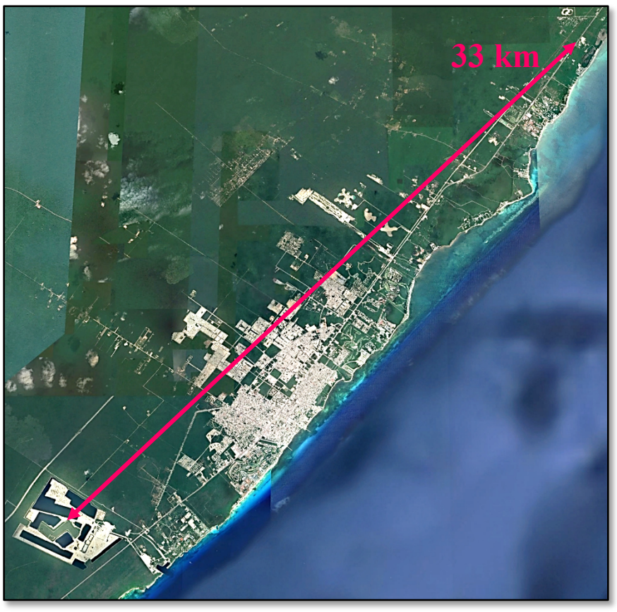
Figure 5: Distance from Jaguar Hit by Car to CALICA<sup>142</sup>

harmony with her ultimate boss's defamatory public narrative of CALICA as an environmental offender.