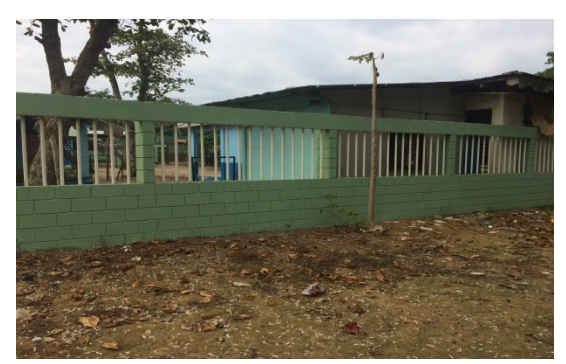
Public primary school