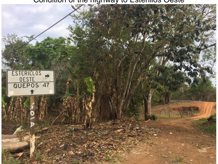
Entrance to Esterillos Oeste

Condition of the highway to Esterillos Oeste