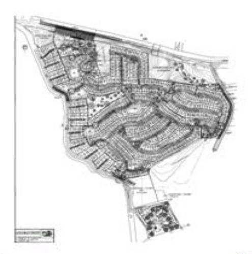
Las Olas Ecosystem