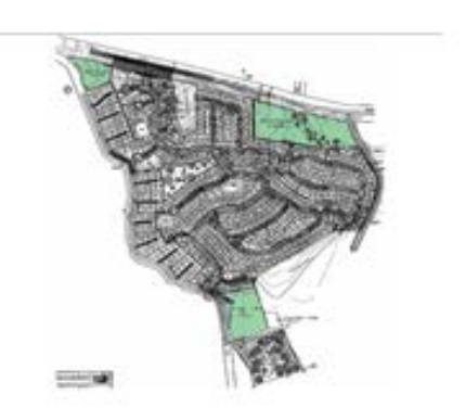
Other Lots site