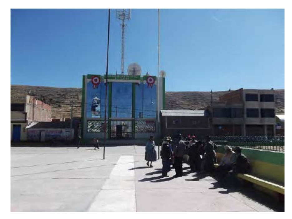
Photograph from the Urban Community of Kelluyo. The mine site is located behind the mountain that appears behind the homes and the municipal building. July 21, 2015.

Photograph of the mine site taken from the Urban Community of Huacullani, July 20, 2015. The site is located behind the homes that appear between the arch and the tower of the local church. ^{41}