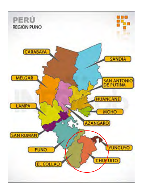
Figure 2 Map of Puno Department. The Santa Ana Project is located in the Chucuito Province, which is in the South East of the Puno Department. <sup>109</sup>