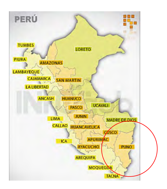
Figure 1 Map of Perú. 108

77. The Santa Ana concessions cover part of the Huacullani and Kelluyo Districts located in the Chucuito Province of the Department of Puno. The Chucuito Province is in the south of the Department, as indicated in the following maps. These maps will be important to understand where the three fronts of protests (Chucuito Province, Melgar Province, and Azángaro Province) originated in 2011, as described in Section II.D.2 below.