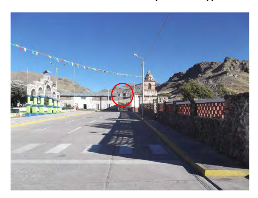
Picture taken from the urban area of Huacullani, July 20, 2015.<sup>111</sup> The Santa Ana project site is circled in red.

79. The pictures below illustrate just how close the Project was to the areas where the members of the communities live their daily lives. In the first picture, taken from the center square of the Huacullani urban area, the project site 3 km away is circled in red. In the second picture, taken from the center square of the Kelluyo urban area, the project site is just on the other side of the hill pictured behind the buildings. Bear Creek engaged with certain communities in the first area, but did not secure the cooperation or support of the second.